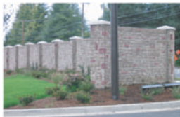
LEDGESTONE PANEL WITH ASHLAR POST